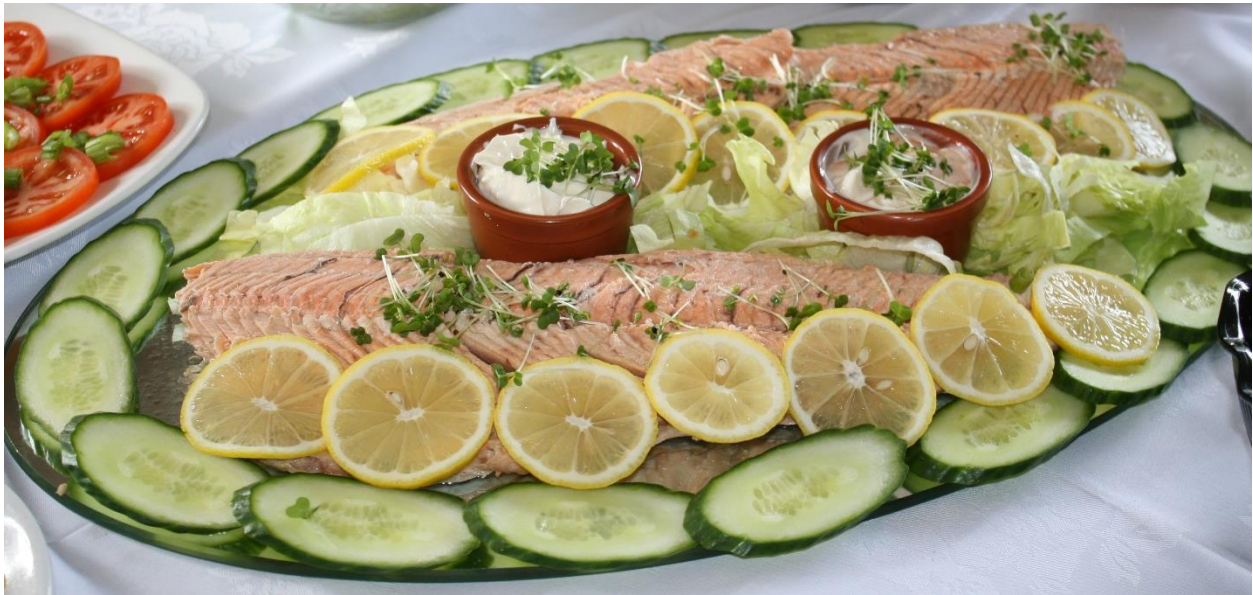
Fillet of Salmon

Fillet of Salmon – flaky lightly seasoned salmon baked in a rich cream and cucumber sauce. Served with selection of fresh vegetables and potato. (2, 3)